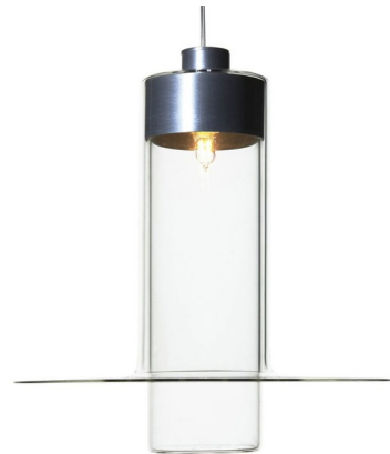
Shown in nickel / clear

LAMP COLOR . . . . . 2700K LUMENS/WATT . . . . . 114.29 LUMINOUS FLUX . . . . . 320 lumens