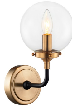
Shown in aged gold brass / clear

The Particles Wall Sconce gets its inspiration from the world of science and the matter all around us. From the backplate rises a curved arm and on top of that arm is an Opal or Clear Glass shade, reminiscent of a scientific particle. Finished in either Aged Gold Brass or Chrome, the Particles is sure to bring a fun and sophisticated touch to your home. Configured with 1 or 2 lights. UL and ETL listed.