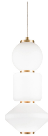
Shown in oxidized gold / opal

PRODUCT DIMENSIONS . . . . . Max Overall Height: 144" COLOR RENDERING . . . . . 90 CRI LAMP COLOR . . . . . 3000K LUMENS/WATT . . . . . 90.00 LUMINOUS FLUX . . . . . 1080 lumens