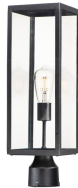
Shown in dark bronze

The Catalina Post Mount brings a minimalist look with industrial undertones to your exterior space. The smooth aluminum frame is complemented by Clear glass, casting warm shadows across your area. Note: Standard post is required, and sold separately.