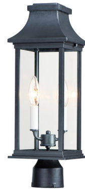
Shown in black / clear

The Vicksburg Post Mount takes inspiration from the yesteryear's coach gas lanterns. A rugged, Black die-cast aluminum frame holds a candle sleeve inside beyond a Clear Glass shell and casts a wonderful glow to the surroundings. Place the Vicksburg in any outdoor area in need of lighting. Note: Post/Pier Mount is required and sold separately.