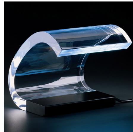
Shown in black / transparent

The Acrilica Table Lamp was designed by Joe Colombo in 1962. It is considered one of the most iconic and innovative lamps of the 20th century. The lamp is made of a single, thick piece of curved acrylic that rests on a Black or the 60th Anniversary limited edition Portoro Marble base. The integrated LED is diffused through the acrylic, creating a soft, indirect glow.