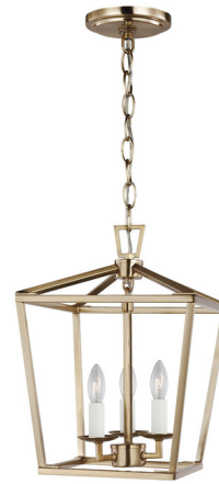
Shown in satin brass

The Dianna Pendant brings an open airy feel with hints of industrialism to a variety of interior spaces. The lantern shaped cage is available with a Satin Brass, Midnight Black, or Brushed Nickel finish in two sizes with Incandescent or LED lamping options. Canopy: 5 inch diameter. Title 24 compliant. Damp location rated. ETL listed.