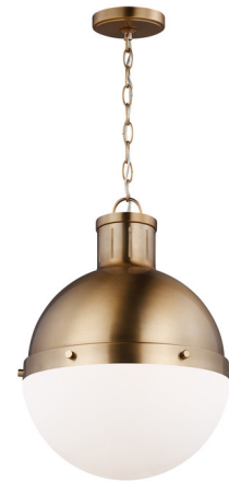
Shown in satin bronze / smooth white

The Hanks Pendant brings a contemporary shape with an industrialized detailed look to a variety of interior spaces. The lower half of the globe has Smooth White glass while the top half has a clean finish with rivet details and is available in Antique Brushed Nickel, Satin Brass, Brushed Nickel, or Midnight Black. Canopy: 5 inch diameter. Damp location rated. ETL listed. Title 24 compliant.