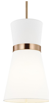
Shown in satin brass / white linen

The Clark Pendant brings a clean tailored look to your interior space. The slim cone shaped linen fabric shade is lightly cinched with a metal band. Available with Incandescent and LED lamp options. LED option is Title 24 Compliant.