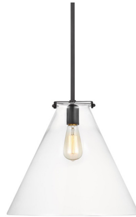
Shown in midnight black / clear

PRODUCT DIMENSIONS . . . . . Max Overall Height: 58.75"