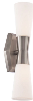
Shown in brushed nickel / opal

LAMP LIFE . . . . . 50000 hours BEAM ANGLE . . . . . 35° COLOR RENDERING . . . . . 90 CRI LAMP COLOR . . . . . 3000K LUMENS/WATT . . . . . 60.48 LUMINOUS FLUX . . . . . 1270 lumens