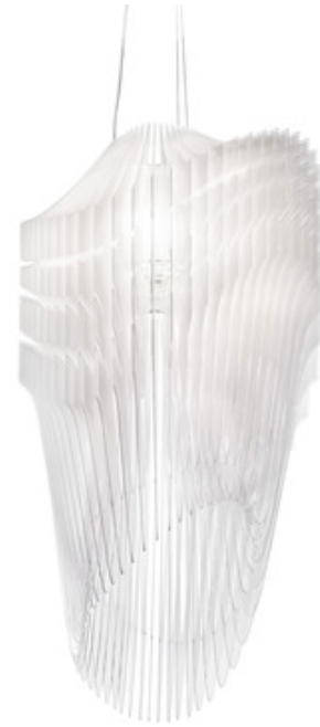
Shown in: White / White Fade

The Avia Pendant, designed by the genius Zaha Hadid, brings the visionary's dynamic luminous architectural object right into your home. Crafted of fifty diverse sections of Cristalflex, the Avia's profile is grandiose and inspires harmony. Place this statement piece over the dining table, in an entryway, or in the office. Available in four sizes. Features upper diffused light source(s) and a directional light source. Available in Black Fade or White Fade Cristalflex with matching canopy. CE listed.