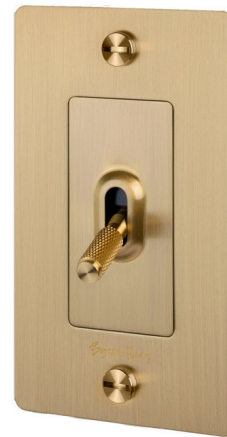
Shown in brass

The Buster + Punch On/Off Toggle Switch is a stylish and functional upgrade for your home. The sleek, minimalist design is made from solid metal, features a diamond cut, cross knurl pattern knob, and is available in a variety of finishes. The switch is finished with a flat plate and signature solid metal money penny buttons. Can be used in 3-way or single pole applications. This Complete Toggle Switch includes one or two 3-way toggle switches, one wall plate, and a detail kit. This switch is a 15 Amp, 120-277V AC, 60 Hz switch. Available with or without the Buster + Punch logo. Note: Both the 1-gang and 2-gang options have a 1/8 inch shadow gap when installed. Learn more about Buster + Punch Electricity Collection here.