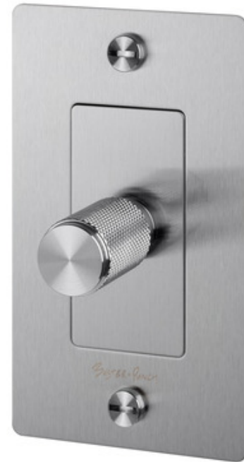
Shown in: Steel

The Buster + Punch Complete Dimmer Switch is made from solid metal with a diamond cut knurled knob available in White, Black, Steel, Smoked Bronze, or Brass. Dims halogen (10-600 watt) incandescent, and most LED (5-150 watt) loads. The Complete Dimmer includes push On/Off rotary dimmer module compatible with 3-way switching, wall plate, and detail kit. Note: Dimmable with leading edge (TRIAC) dimmers. Does not dim with MLV or 0-10V dimmers. See attached manufacturer spec for more information. Disclaimer: Only one dimmer should be used per 3-way circuit; 2 Gang Dimmers should not share a 3-way circuit.