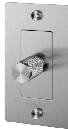
Shown in steel

The Buster + Punch Complete Dimmer Switch is made from solid metal with a diamond cut knurled knob available in White, Black, Steel, Smoked Bronze, or Brass. Dims halogen (10-600 watt) incandescent, and most LED (5-150 watt) loads. The Complete Dimmer includes push On/Off rotary dimmer module compatible with 3-way switching, wall plate, and detail kit. Note: Dimmable with leading edge (TRIAC) dimmers. Does not dim with MLV or 0-10V dimmers. See attached manufacturer spec for more information. Disclaimer: Only one dimmer should be used per 3-way circuit; 2 Gang Dimmers should not share a 3-way circuit.