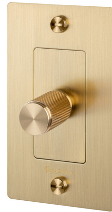
Shown in brass

The Buster + Punch Complete Dimmer Switch is made from stainless steel with a diamond cut cross pattern knurl knob or linear pattern knurl knob. Dims halogen / incandescent (10-600 watt), and most LED (5-150 watt) loads compatible with Forward Phase / Leading Edge dimmers. The cross knurl pattern switch is finished with a flat plate and solid metal coin screws, and the linear knurl pattern switch is finished with a flat plate and six pointed Torx screws. The Complete Dimmer includes push On/Off rotary dimmer module compatible with 3-way switching, wall plate, and detail kit. Learn more about Buster + Punch Electricity Collection here.