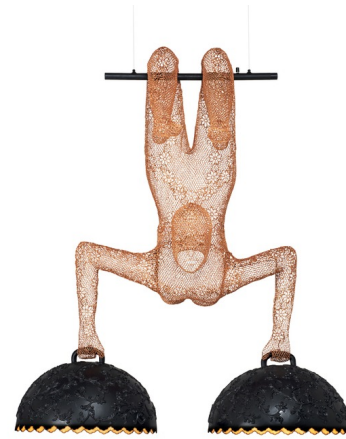
Shown in copper

The Limbo Trapeze Pendant, designed by Kenneth Cobonpue is as fantastical as it is functional. Capturing the moment of an aerialist in mid-flight, the Limbo Trapeze's handwoven gossamer wires brings life to the fixture. Place this pendant over the dining table or entryway to add a jaw-dropping, brilliantly lit spectacle to your home.