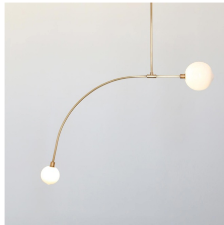
Shown in brushed brass / opaque white

PRODUCT DIMENSIONS . . . . . Canopy: 5" diameter LAMP LIFE . . . . . 25000 hours