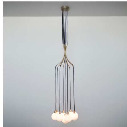
Shown in brushed brass / opaque white