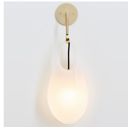
Shown in brushed brass / opaque white

PRODUCT DIMENSIONS . . . . . Canopy: 5" diameter LAMP LIFE . . . . . 15000 hours COLOR RENDERING . . . . . 90 CRI LAMP COLOR . . . . . 3000K LUMENS/WATT . . . . . 88.89 LUMINOUS FLUX . . . . . 800 lumens