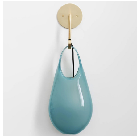
Shown in brushed brass / opaque new blue

The Hold Wall Sconce's contemporary design and superb versatility combine to create a truly unique fixture. A hand-blown Czech glass shade suspends from a Brass hook and beautifully diffuses the light that's emitted from the Hold. Place the Hold in the bedroom, dining room, or anyplace where layered lighting is needed.