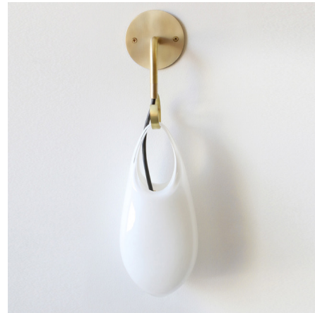
Shown in brushed brass / opaque white

The Hold Wall Sconce's contemporary design and superb versatility combine to create a truly unique fixture. A hand-blown Czech glass shade suspends from a Brass hook and beautifully diffuses the light that's emitted from the Hold. Place the Hold in the bedroom, dining room, or anyplace where layered lighting is needed.