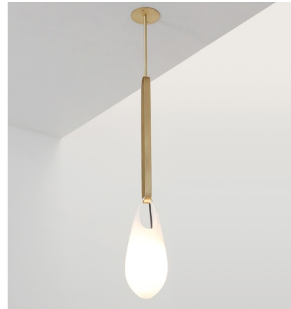
Shown in brushed brass / opaque white

The Hold Pin Pendant features elegant curves and hand-made materials to create a stunning example of contemporary design. A hand-blown Czech glass shade suspends elegantly from a continuously curved brass bar. Small details are created by the Fabric cord that hold the bulb within the Glass diffuser. Note: One 6 inch, two 12 inch, and one 18 inch downrods are included as standard and allow for field adjustability. Custom, non-adjustable overall heights can be specified to order (additional fees may apply).