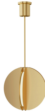
Shown in natural brass

The Bau Pendant features integrated LED mounted in thin rounded metal stamped aluminum plates. Available in three sizes in Nightshade Black and Natural Brass (will patina over time) finish. Can be installed on a sloped ceiling up to 20 degrees. ETL listed. Title 24 compliant. Suitable for damp locations. NOTE: Small size requires a junction box to hold a minimum of 75 pounds. Medium size requires a junction box to hold a minimum of 100 pounds. Large size requires a junction box to hold a minimum of 150 pounds.