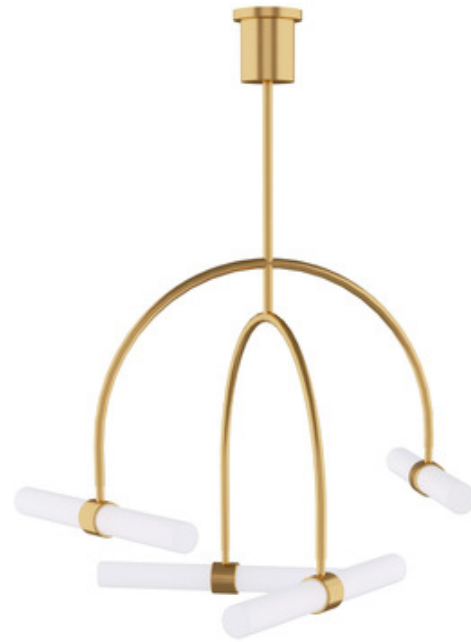
Shown in: Natural Brass / White

The Calumn Chandelier features an elongated metal arched frame with cascading tubular glass shades. The Natural Brass finish is a living finish and will patina over time.