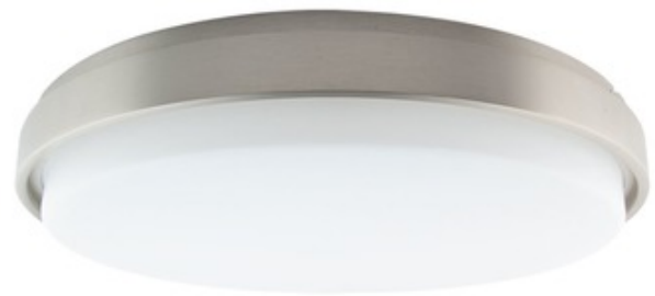
Shown in: Brushed Nickel / White Acrylic

The Lithium Wall/Ceiling Light is constructed of die-cast aluminum in Brushed Nickel finish with an acrylic diffuser. Can be mounted on ceiling or wall in all orientations. LED driver concealed with the fixture. ETL listed. Features a 120/277V driver dimmable with an electronic low voltage (ELV) or Triac dimmer, sold separately. 15 and 18 inch sizes available with an Emergency Battery Backup option. Includes LED module with five switchable color temperature options: 2700K, 3000K, 3500K, 4000K or 5000K.