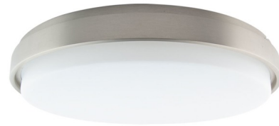
Shown in brushed nickel / white acrylic