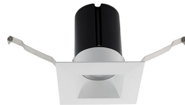
Shown in white / frosted