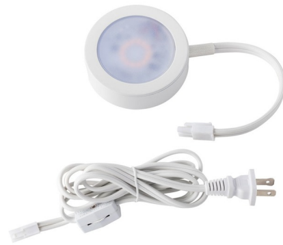
Shown in white / white acrylic