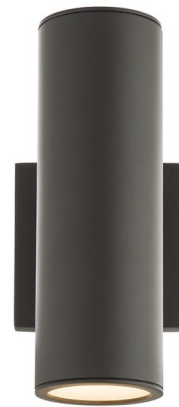
Shown in bronze

BEAM ANGLE . . . . . 35° COLOR RENDERING . . . . . 80 CRI LAMP COLOR . . . . . 3000K LUMENS/WATT . . . . . 42.50 LUMINOUS FLUX . . . . . 765 lumens