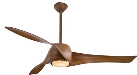
Shown in distressed koa / etched opal

The Artemis Smart Fan with Light features a distinctive 58 inch span with 3 aerodynamic polycarbonate blades with a variable pitch combined with a DC 153 X 20mm motor allowing for optimum airflow. Includes an integrated LED light with an etched opal glass diffuser as well as an RC400 Hand Held remote and cap for non-light use. Smart Control enabled so you can control your fan and light with your smart phone. 6 inch downrod included. Compatible with WC400 wall control, sold separately. Available in a Distressed Koa, Liquid Nickel, Maple, White or Coal motor with matching blades or a Translucent motor with Brushed Nickel Blades.