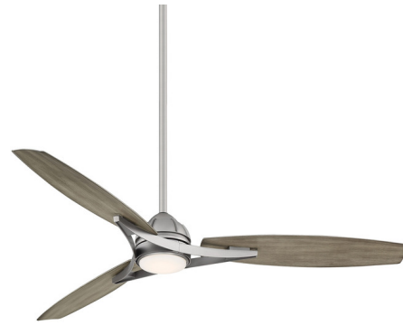
Shown in burnished nickel / seashore grey

LAMP LIFE . . . . . 30000 hours COLOR RENDERING . . . . . 92 CRI LAMP COLOR . . . . . 3000K LUMENS/WATT . . . . . 36.10 LUMINOUS FLUX . . . . . 722 lumens