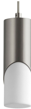
Shown in satin nickel / matte white acrylic

COLOR RENDERING . . . . . 90 CRI LAMP COLOR . . . . . 3000K LUMENS/WATT . . . . . 25.48 LUMINOUS FLUX . . . . . 158 lumens