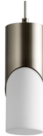
Shown in satin nickel / matte white acrylic

The Ellipse Mini Pendant features a clean and simple design with a metallic body complemented by either a Opal White or a Matte White Acrylic diffuser. TRIAC and ELV dimming at 120V. 0-10V dimming at 277V.