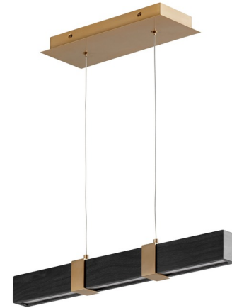
Shown in aged brass / black oak / matte white acrylic