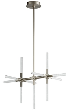
Shown in satin nickel / clear bubble glass

PRODUCT DIMENSIONS . . . . . Downrods: 2 - 8", 2 - 12", and 3 - 16" COLOR RENDERING . . . . . 90 CRI LAMP COLOR . . . . . 3000K LUMENS/WATT . . . . . 397.14 LUMINOUS FLUX . . . . . 834 lumens