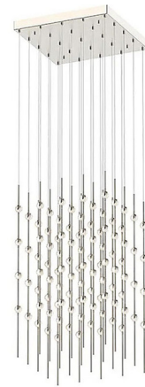
Shown in satin nickel / clear

COLOR RENDERING . . . . . 90 CRI LAMP COLOR . . . . . 3000K LUMENS/WATT . . . . . 7,750.00 LUMINOUS FLUX . . . . . 15500 lumens