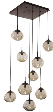
Shown in flat bronze / bronze geo

PRODUCT DIMENSIONS . . . . . Max Overall Length: 135" COLOR RENDERING . . . . . 93 CRI LAMP COLOR . . . . . 2700K LUMENS/WATT . . . . . 588.46 LUMINOUS FLUX . . . . . 3060 lumens