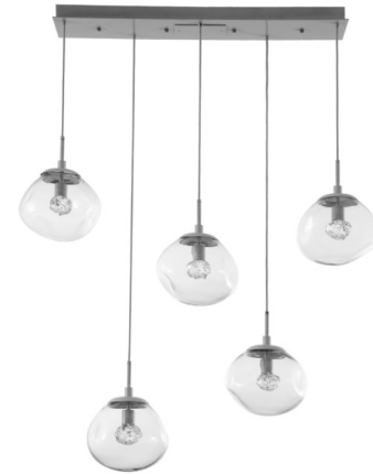
Shown in beige silver / clear floret

PRODUCT DIMENSIONS . . . . . Canopy: 34.3" x 6.4" Rect. COLOR RENDERING . . . . . 93 CRI LAMP COLOR . . . . . 2700K LUMENS/WATT . . . . . 326.92 LUMINOUS FLUX . . . . . 1700 lumens