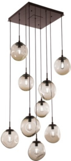
Shown in: Flat Bronze / Bronze

The Aster Square Multi Light Pendant is a clean simple piece, perfect in a variety of interior spaces. The artisan blown and cast glass, undulated gently in an organic form, creates an interesting conversation piece. Each Piece is a unique work of art. Available in 9 and 12 light options.