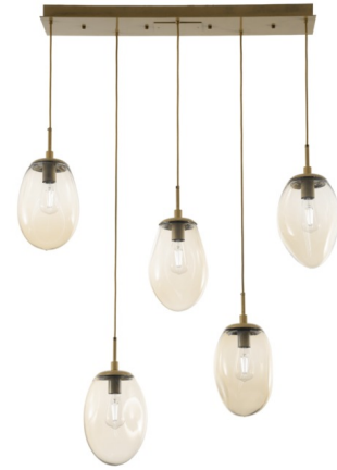
Shown in gilded brass / amber

The Meteo Linear Multi Light Pendant is a clean simple piece, perfect in a variety of interior spaces. The artisan blown and cast glass, undulated gently in an organic form, creates an interesting conversation piece. Each Piece is a unique work of art. Choose from Smoke, Clear, Bronze, or Amber glass with a Matte Black, Metallic Beige Silver, Flat Bronze, or Gilded Brass finish. Available in 5, 7, 9, and 10 light options. Made in the USA. UL listed.