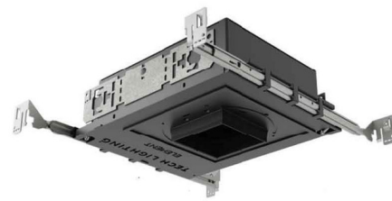
Shown in black powder coat