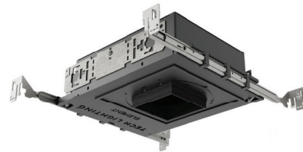
Shown in black powder coat