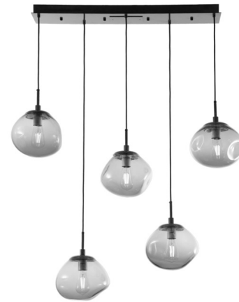
Shown in matte black / smoke

PRODUCT DIMENSIONS . . . . . Canopy: 34.3" x 6.4" Rect.