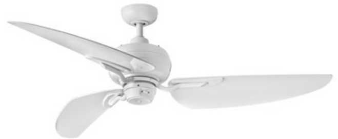
Shown in: Appliance White / Appliance White

The Bimini Fan is inspired by the Caribbean island with the same name. Supreme air movement is accomplished through its three blades with a 60 inch span set at a 14 degree pitch combined with the powerful 188X22mm motor. Available with a Metallic Matte Bronze motor with Metallic Matte Bronze blades, Appliance White motor with Appliance White blades, or a Brushed Nickel motor with Weathered Wood blades. Includes a 4.5 inch downrod as well as a 3 speed, non-reversing wall control. The Bimini Fan has the ability to be installed on sloped ceilings with up to a 23 degree slope. UL listed, wet locations.