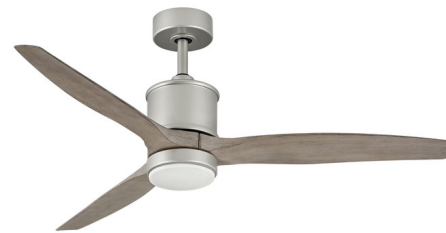
Shown in brushed nickel / weathered wood

COLOR RENDERING . . . . . 90 CRI LAMP COLOR . . . . . 3000K Warm Dim LUMENS/WATT . . . . . 82.50 LUMINOUS FLUX . . . . . 1320 lumens