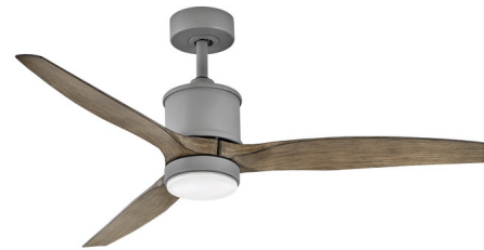
Shown in graphite / driftwood

COLOR RENDERING . . . . . 90 CRI LAMP COLOR . . . . . 3000K Warm Dim LUMENS/WATT . . . . . 82.50 LUMINOUS FLUX . . . . . 1320 lumens