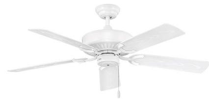
Shown in appliance white / appliance white

The Oasis Fan is simple yet has a classic all-you-need design that can be used for both indoor and outdoor spaces. With 5 blades at a 52 inch span and set at a 16 degree pitch this fan provides ample amounts of airflow for any space. Available in 52 inch and 60 inch blade span with a Brushed Nickel motor with Silver Blades, Metallic Matte Bronze motor with Metallic Matte Bronze blades, Appliance White motor with Appliance White Blades, Graphite Motor with Driftwood Blades, Chalk White motor with Chalk White blades, or a Matte Black finish with Matte Black blades. Includes a 4.5 inch downrod and is operated by a 3-speed pull chain and has a manual reverse switch. UL listed, wet locations. NOTE: The 60 inch size is only available in Matte Black.