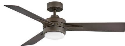
Shown in metallic matte bronze / metallic matte bronze / walnut

COLOR RENDERING . . . . . 90 CRI LAMP COLOR . . . . . 3000K Warm Dim LUMENS/WATT . . . . . 93.75 LUMINOUS FLUX . . . . . 1500 lumens