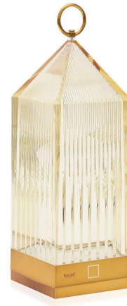
Shown in transparent amber