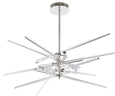
Shown in polished stainless steel / clear

PRODUCT DIMENSIONS . . . . . Min/Max Overall Height: 59 1/16" / 66 15/16" LAMP COLOR . . . . . 3000K LUMENS/WATT . . . . . 15.50 LUMINOUS FLUX . . . . . 310 lumens