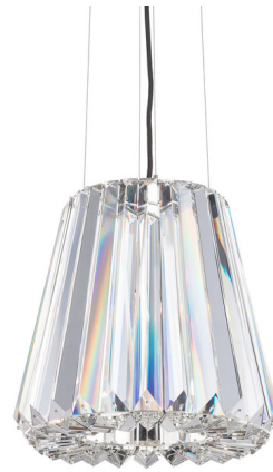
Shown in brushed stainless steel / clear

The Glitters Pendant's ornamental composition blends classical design with high quality materials to create a work of romantic functionalism. Hand-blown Czech Glass pleats with right angles to form the stunning shade and makes the Glitters a true artisan's dream. Place this pendant anyplace in the house where a sophisticated statement is needed. Available in one round and two oval size options. UL listed.